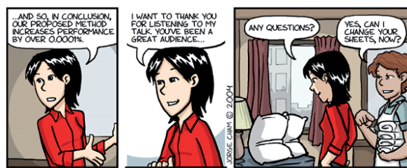
„Piled Higher and Deeper“ by Jorge Cham

The motto "Broaden your horizons" supports this vision of the broad spectrum of activities within KIT.